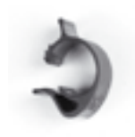
Run clips x30