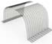
Left & Right extension panels