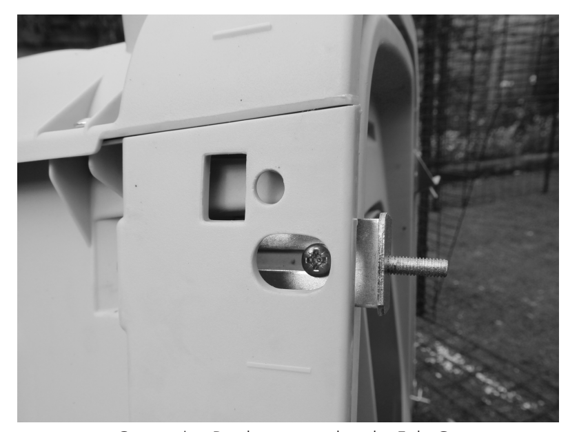
Connection Bracket screwed to the Eglu Go

Move the Eglu Go so that the threaded part of the Connection Brackets are pushed through the mesh of the Run Connection Panel. Attach to the Walk in Run using 4 Washers and 4 Wingnuts.