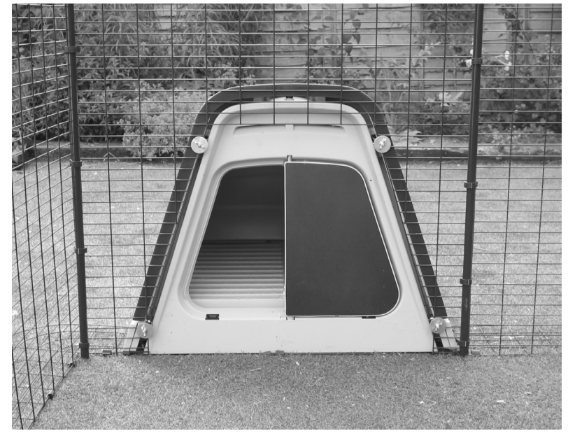
Connection brackets attached to Run with Washers and Wingnuts