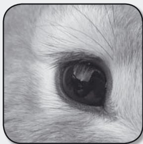
Check your bunnies eyes are free of any discharge

Your rabbits eyes should be bright and glossy. There shouldn't be any discharge or dullness. If you notice any discharge it could be that your rabbit has scratched its eye or if it is cloudy it could be related to its teeth. Either way it will be necessary to take your rabbit along to the vet for a check up.