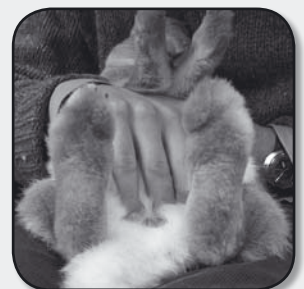
Checking a rabbit's sex

When buying rabbits you will probably be looking for a male and a female. As well as asking the person selling the rabbits it is very sensible to check for yourself. It is probably sensible to ask the person selling it to hold the rabbit while you have a look at it's genital area. A male rabbit has a round opening and a female rabbit has a slit.