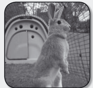
Alert - ears up and nose twitching

Crepuscular: Rabbits are crepuscular which means that they are most active in the morning and evening. So this means that they will be especially pleased to see you in the mornings and evening!