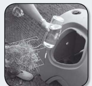
Refilling hay and water