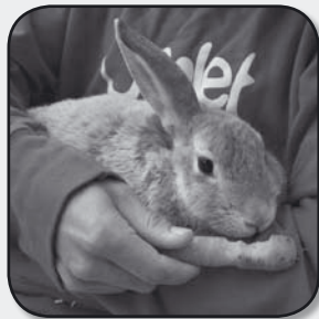
Use harder vegetables as treats rather than 'wet' tomatoes or lettuce

If you want to feed your rabbits vegetables, be careful and introduce them bit by bit. 'Wet' foods as they are known can soon upset your rabbit's stomach. Try carrots or turnips rather than the wetter tomato or lettuce. As with any new food that you give your rabbits, don't make any quick changes.