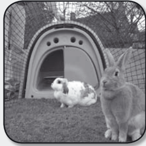
Your bunnies can choose when to go outside

Rabbits love to play and the large eglu run has over 2 square meters of secure space and lots of height for them to hop around in. Because the eglu and run work together as a complete habitat, your rabbits have the freedom to choose to be inside or out throughout the day and night.