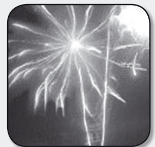
Protect your rabbits before you let fireworks off

Not only was Guy Fawkes being reckless in his attempt to blow up the Houses of Parliament but had his explosives gone off he would have frightened the entire rabbit population of Westminster half to death. To avoid giving your rabbit a sleepless night on the fifth of November, you should take them indoors as far away from all the commotion as possible. Do this earlier in the day, not five minutes before, and it will give your rabbits a chance to acclimatise to their new surroundings.