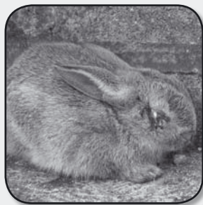
A wild rabbit with Myxomatosis

If your rabbit hasn't been vaccinated and contracts Myxi the kindest thing is to have them put down by a vet. As the disease is spread by insects, this is another reason to keep your rabbit's house as clean and unattractive to insects as possible.