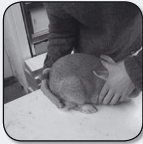
Support your rabbit's weight whilst lifting

If a pet rabbit isn't used to being picked up it may take some time before it is happy for you to do so. A good technique for lifting your rabbit is to put one hand on the back of its neck and slowly bring it round to the front. At the same time put your other hand underneath the rabbit's hindquarters to support its weight whilst lifting. Remember, if a rabbit were to be picked up from above in the wild it would usually be in something's mouth.