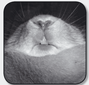
Rabbits noses twitch to help them smell better

Why does a rabbits nose twitch? Its so that all of the highly sensitive receptors are exposed to the air. If your rabbit doesn't twitch its nose its a sign that it is very relaxed.