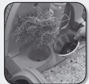
Use the bowl to stop your rabbits scattering their food

There can be a drawback with a rabbit mix. Although it looks more interesting than the extruded foods or pellets, some rabbits can be a bit fussy and not eat all of the mix leaving it deficient. If this is the case then a pelleted food is a better option. It may look boring to us but rabbits tend to like them.