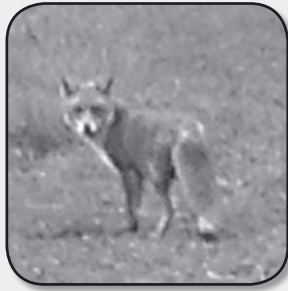
An 'English' looking cross-breed

Fantastic Mr Fox is a graduate of the school of deception and cunning but he has met his match in the eglu. Together, the eglu and run form an extremely secure area for your rabbits. Features such as the anti-tunneling skirt, 3mm steel weld mesh run and recessed handles on the eglu make it as safe a rabbit house as it is possible to buy. Here are some useful tips which make it less likely that a fox will get even so much as a sniff of your rabbits.