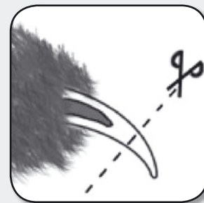
Trim nails back to half a centimeter from the quick

Like its teeth a rabbit's nails grow remarkably quickly and will need trimming around once every two months although this does depend on how much your rabbit is able to wander around and dig in the garden. A simple guide is to make sure that your rabbit's nails don't stick out beyond the fur.