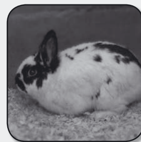
An 'English' looking cross-breed.