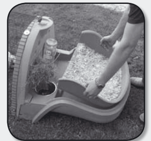
Changing the bedding

Check the eglu dropping tray, if there are any droppings or soiled bedding then remove the tray, empty it then wipe it clean. You can use a pet disinfectant but never use household cleaners. Then simply put fresh bedding in the tray and pop it back in the eglu. This only takes a few minutes and will help keep your rabbit healthy and happy.