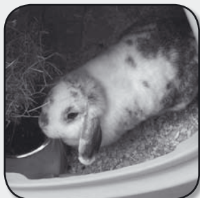
In the winter rabbits will eat more to keep warm

Food: Don't be surprised by your rabbits eating more in the chilly months. They are using up lots of extra energy to keep warm. Keep an eye on their weight though to make sure that they aren't pretending to shiver when you are about so that they get extra treats!