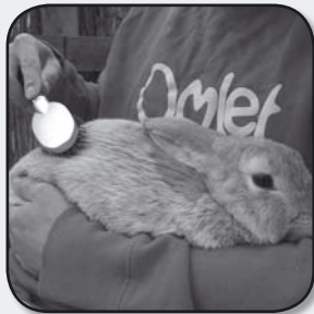
Grooming, a good opportunity to spend time with your rabbit

Rabbits love to be clean and will spend much of the day cleaning and preening themselves. Although not strictly necessary, grooming does provide a good opportunity for you and your rabbit to spend some quality time together. Every 3 months or so your rabbit will shed some of its fur alternating between a light and heavy shed. A good brush can help the loose fur to come out.